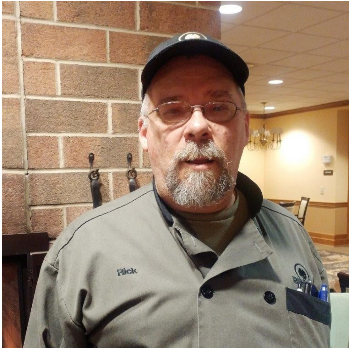
Story on Page 4