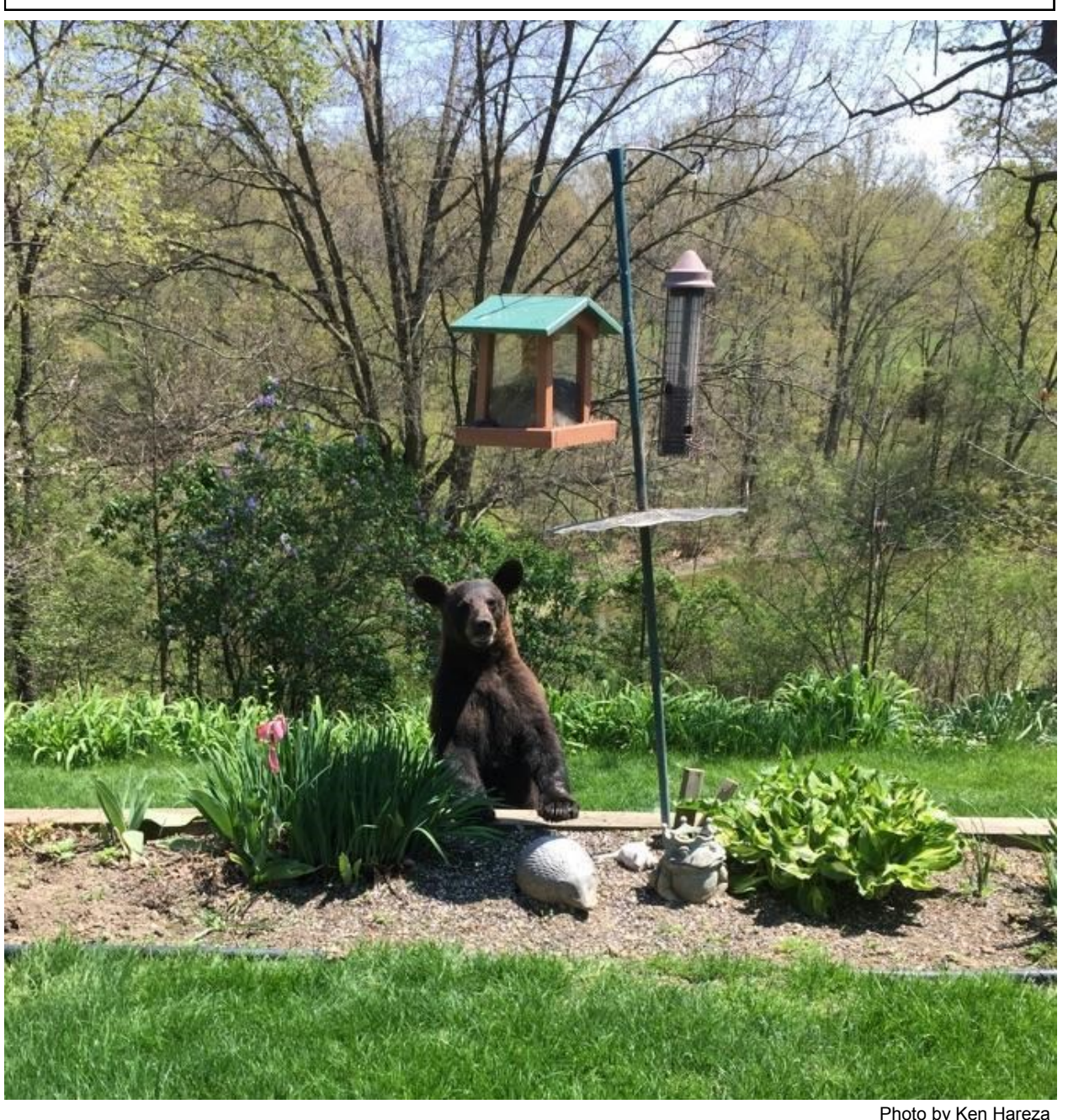
And it's "bearly" Spring...

Summer 2015 "For the residents, by the residents" Vol. XVI No. 6